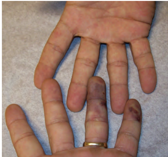
Figure 3. Improvement in the appearance of the fourth and fifth fingers of the left hand two days after initiation of chemotherapy.