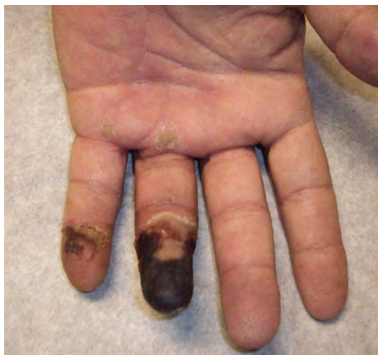
Figure 4. Eventual loss of the distal portion of the fourth finger of the left hand; the fifth finger recovered completely.

nia syndrome, thrombosis, dermatomyositis, eosinophilia, and hypercalcemia are not uncommon in lung carcinoma. 8 However, digital ischemia in association with lung carcinoma remains an unusual and rare paraneoplastic manifestation, as it has since first reported in 1884 by O'Connor. 6,7,9 Also, when associated with a malignancy, digital ischemia may be a complication of its own, or it may be associated with a form of Raynaud's phenomenon.