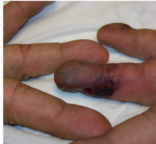
Figure 1. Appearance of the fourth and fifth fingers of the left hand during initial exam.

A CT chest scan following the 3 cycles of docetaxel and carboplatin showed progression of the lung carcinoma. He began chemotherapy with pemetrexed (500 mg/m 2 ) with gemcitabine (1000 mg/m 2 ) and bevacizumab (15 mg/kg) for 3 cycles. Another CT chest scan showed further progression of the lung