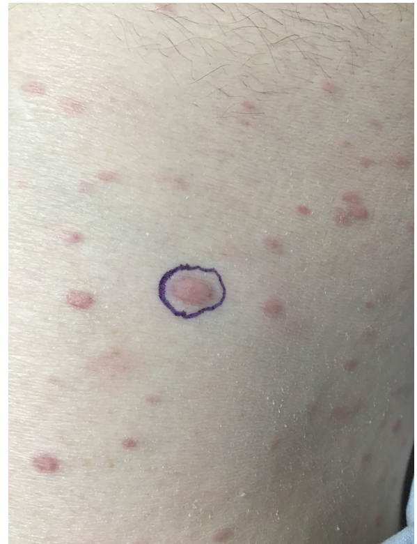
Figure 2. Photo of Widespread Eruption of Leukemia Cutis Lesions Over the Patient's Trunk

sure device also was used to further optimize wound care. Surgical pathology confirmed the working diagnosis of Fournier's gangrene (Figure 1). The leukocytosis temporarily resolved with these interventions. Broad-spectrum antibiotics were discontinued after 29 days, and prophylactic levofloxacin was started in the setting of neutropenia. Cyto-reductive therapy with hydroxyurea eventually was initiated after recurrence of leukocytosis with circulating blasts. As the patient's wound continued to heal, he developed an eruption of violaceous papules and nodules involving most of his body (Figure 2). Punch biopsy confirmed the lesions to be leukemia cutis.