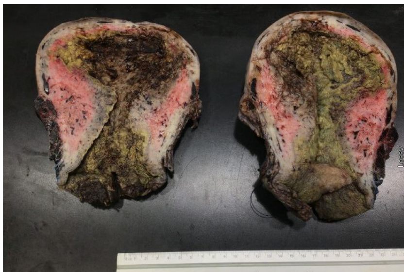
Gross uterine specimen for Case 1 demonstrating diffuse decidual and myometrial necrosis with complete cervical necrosis.