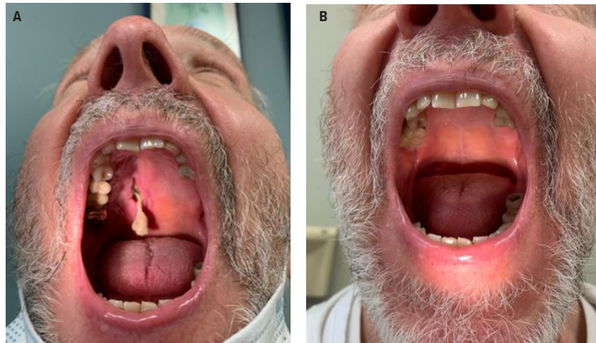
1A. Photo demonstrating mass eroding through the right hard palate, taken prior to biopsy. 1B. Photo demonstrating resolution of hard palate defect at 6-month follow-up.